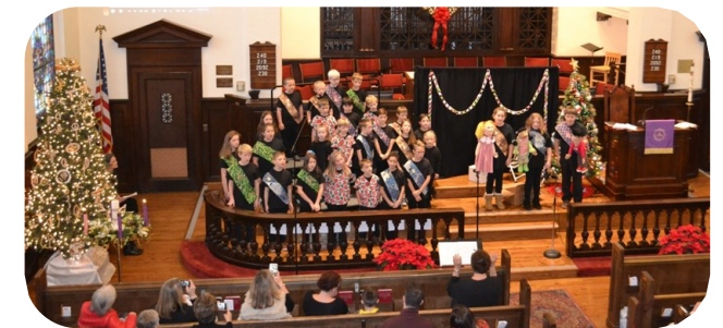
The children did an incredible job with their Christmas musical Christmas Around the World on December 16th! The choirs and puppeteers were outstanding!